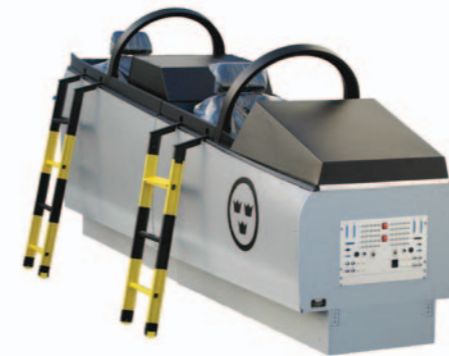
Platform for flight simulator